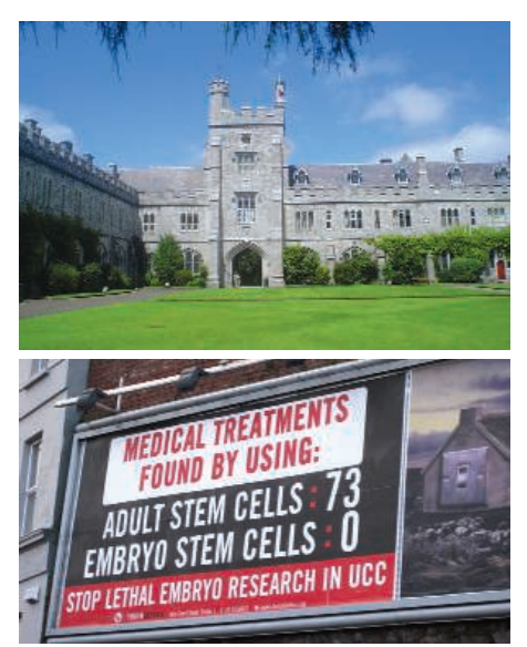
Controversial move. University College Cork (above) issued regulations on research with hESCs, prompting a billboard campaign by opponents of such work.

In 2008, University College Cork (UCC) became the first major university in Ireland to explicitly allow work with hESCs. The univer-